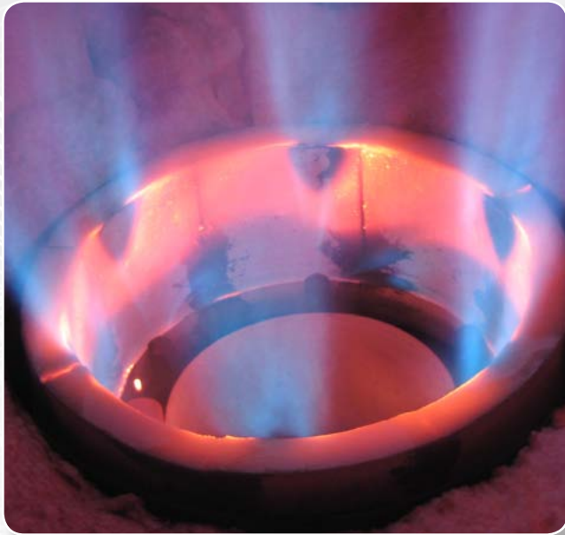
AK Staged Air Low Emissions Combination Burner Operating on Gas Only