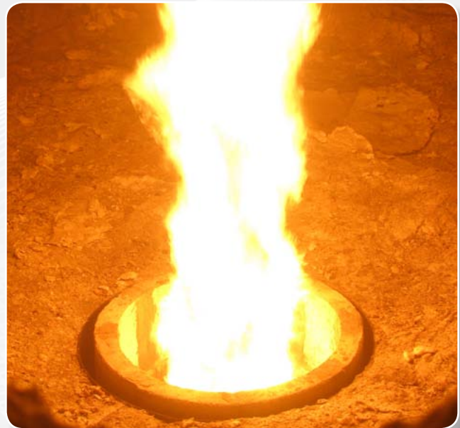
AK Staged Air Low Emissions Combination Burner Operating on Oil Only