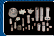
PARTS & SERVICE

COMBUSTION AND ENVIRONMENTAL SOLUTIONS. PURE AND SIMPLE.®