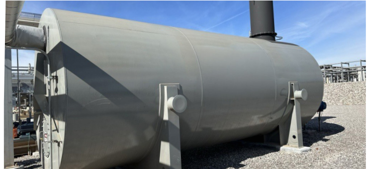
HELIFLO Direct-Fired Heater