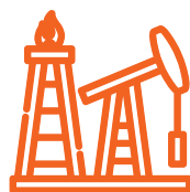
Oil & Gas Processing