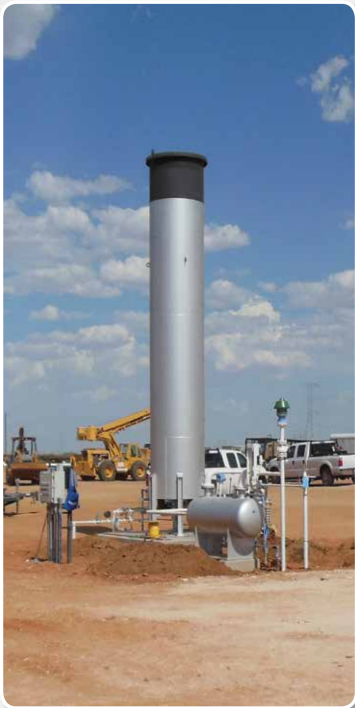
Enclosed Flame Wellhead Flare System